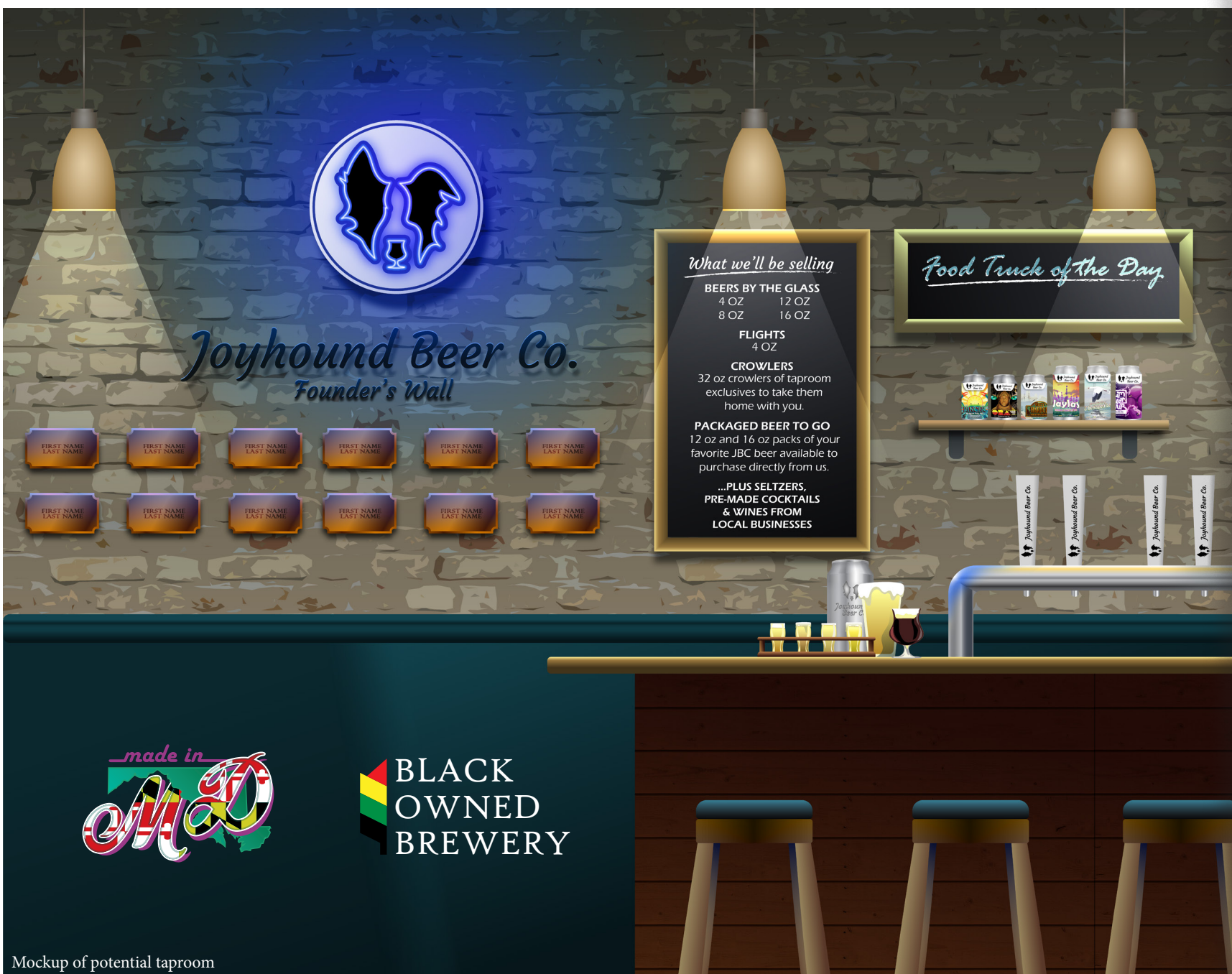
Mockup of potential taproom